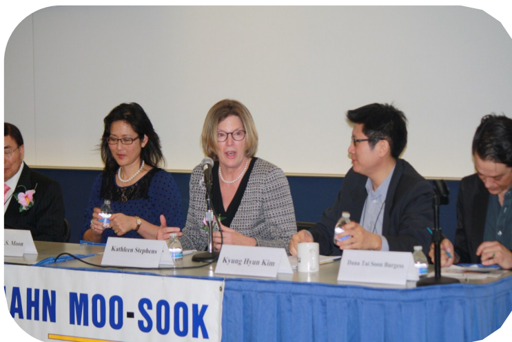
Former U.S. Ambassador to the R.O.K, Kathleen Stephens speaking at a panel at The 21st Hahn Moo-Sook Colloquium in the Korean Humanities (11/09/2013)

November 8, 2013: "The 6th Annual Conference on U.S.-China Economic Relations and China's Economic Development," co-sponsored by the Institute for International Economic Policy , the GW Confucius Institute and the Center for International Business Education and Research .